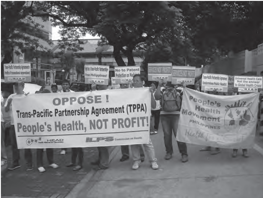
Image A1.3 Trade treaties are major barriers to development: Protests against TPPA in the Philippines (PHM Philippines)