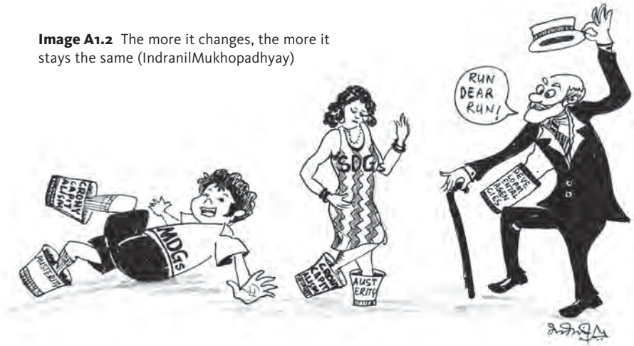
Image A1.2 The more it changes, the more it stays the same (IndranilMukhopadhyay)

development goals, “so sprawling and misconceived...that the entire enterprise is set up to fail.” (The Economist, 2015). This was a common refrain from mainstream economists who preferred the narrow, precise and non-threatening style of the MDGs, non-threatening because these did not question the underlying logic of either neoliberal globalization or global capitalism. The new set of 17 goals with 169 targets (and 230 indicators) unquestionably comprises a sprawling agenda for change (see Table A1.1), but such an agenda is “misconceived” only if one holds to a simplifying market fundamentalism that views human development as a matter of a few inexpensive interventions