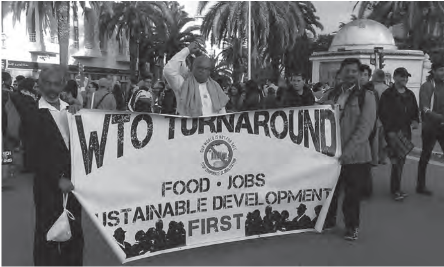
Image A1.4 Trade rules undermine food security: Activists demonstrate at the World Social Forum in Tunis in 2015